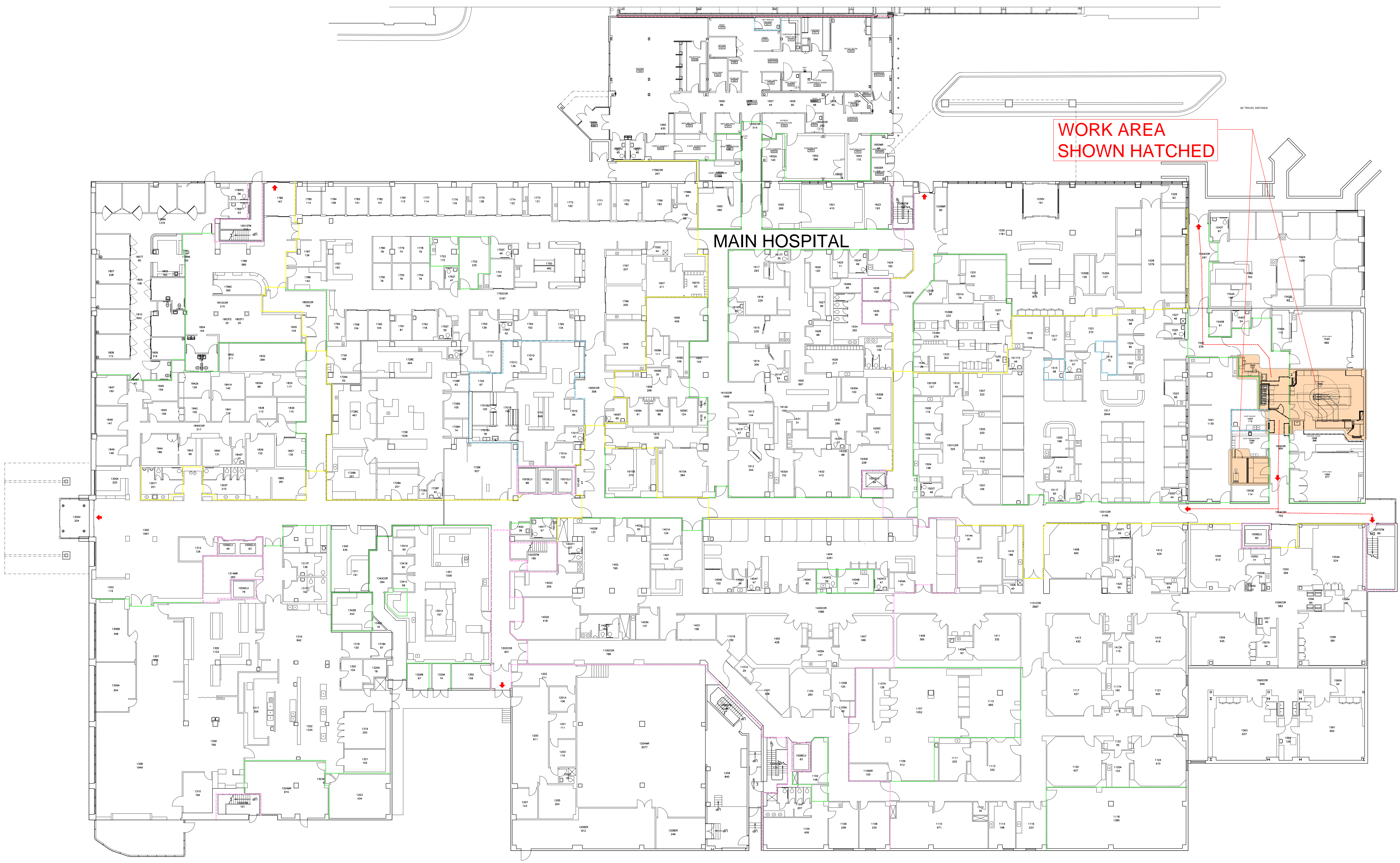
1 OVERALL FIRST FLOOR / LIFE SAFETY PLAN NTS